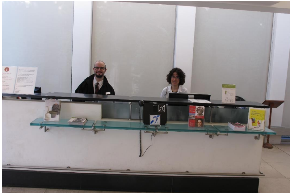
The main entrance